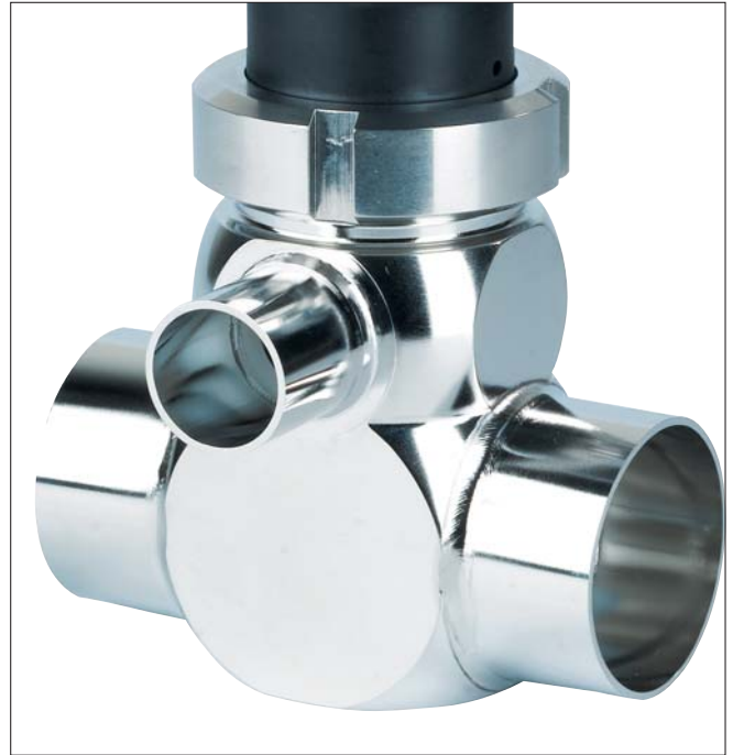
VESTA® type HCA mixed matched sterile valves, DN 50 / 25